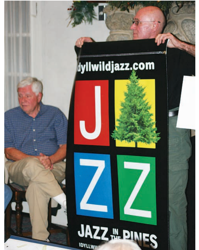
This Jazz in the Pines banner is one of the 19 organization banners the Art Alliance of Idyllwild unveiled at the Creekstone Inn on Wednesday, Feb. 12. The banner hanging is anticipated for the last week of February or first week of March.