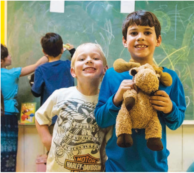
Kids came to the Valentine's Day Pajama Party at Town Hall Friday night, giving their parents a chance to have a romantic night. The kids camped out in their sleeping bags to watch movies and enjoy snacks Town Hall provided.