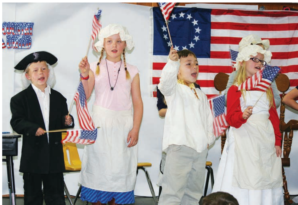
A patriotic play was staged at Idyllwild School last Friday. The children told the story of Betsy Ross and sang patriotic favorites such as, "You're a Grand Old Flag" and "This Land is Your Land," to a packed auditorium.