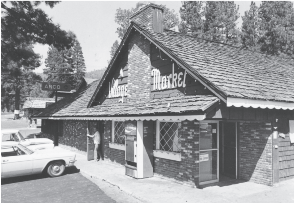
Village Market had just been sold in this October 1973 photo. FILE PHOTO

45 years ago - 1972 Only 17 members attended the special meeting