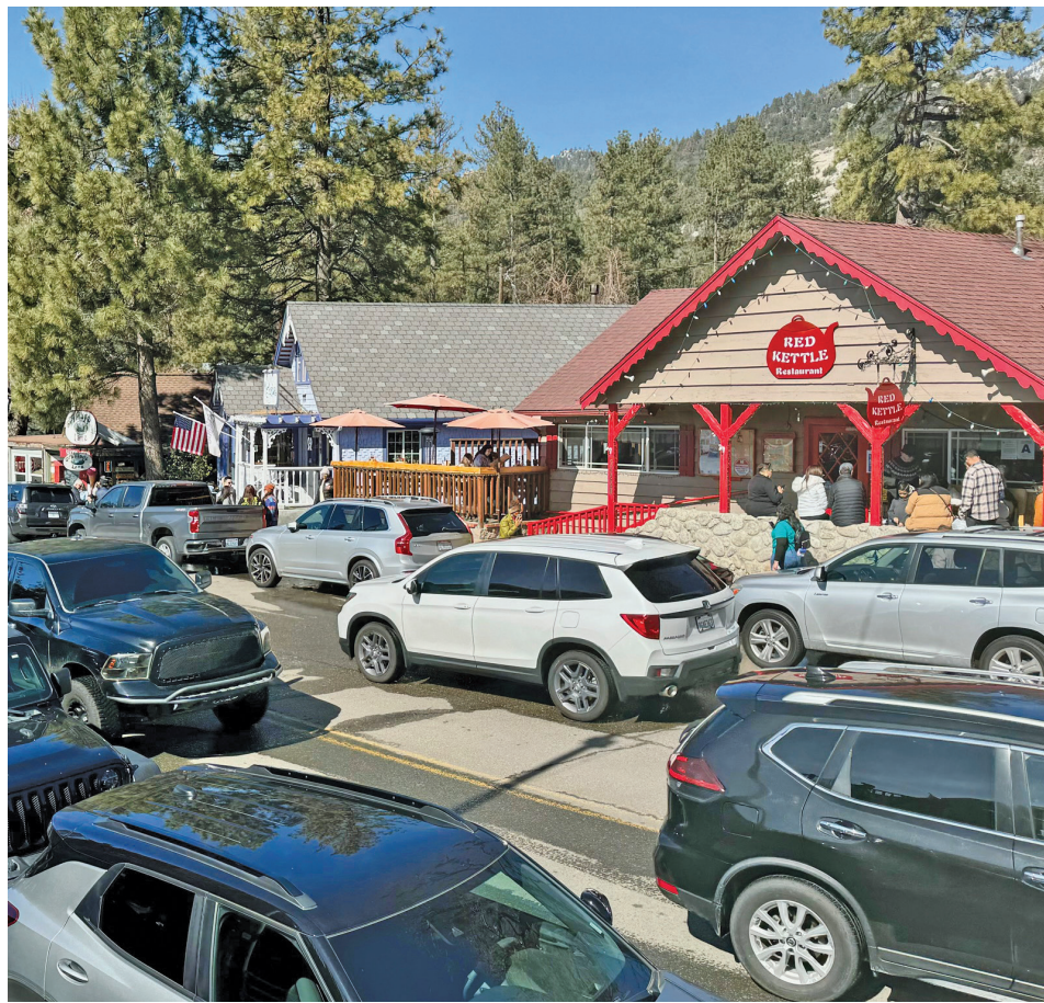
The three-day Presidents Day weekend brought thousands of snow lovers up from the flat lands.

The compositions that will be performed were mostly selected by the guitarists, he said. "I did suggest a few that should be performed by somebody. We exchanged ideas via the cell phone text group."