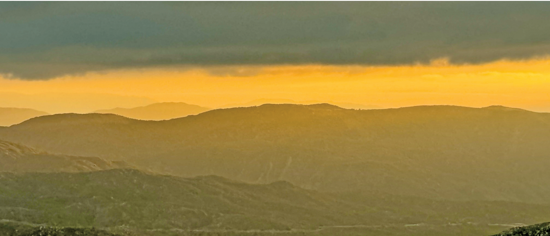
Sunday evening sunset before the next storm.