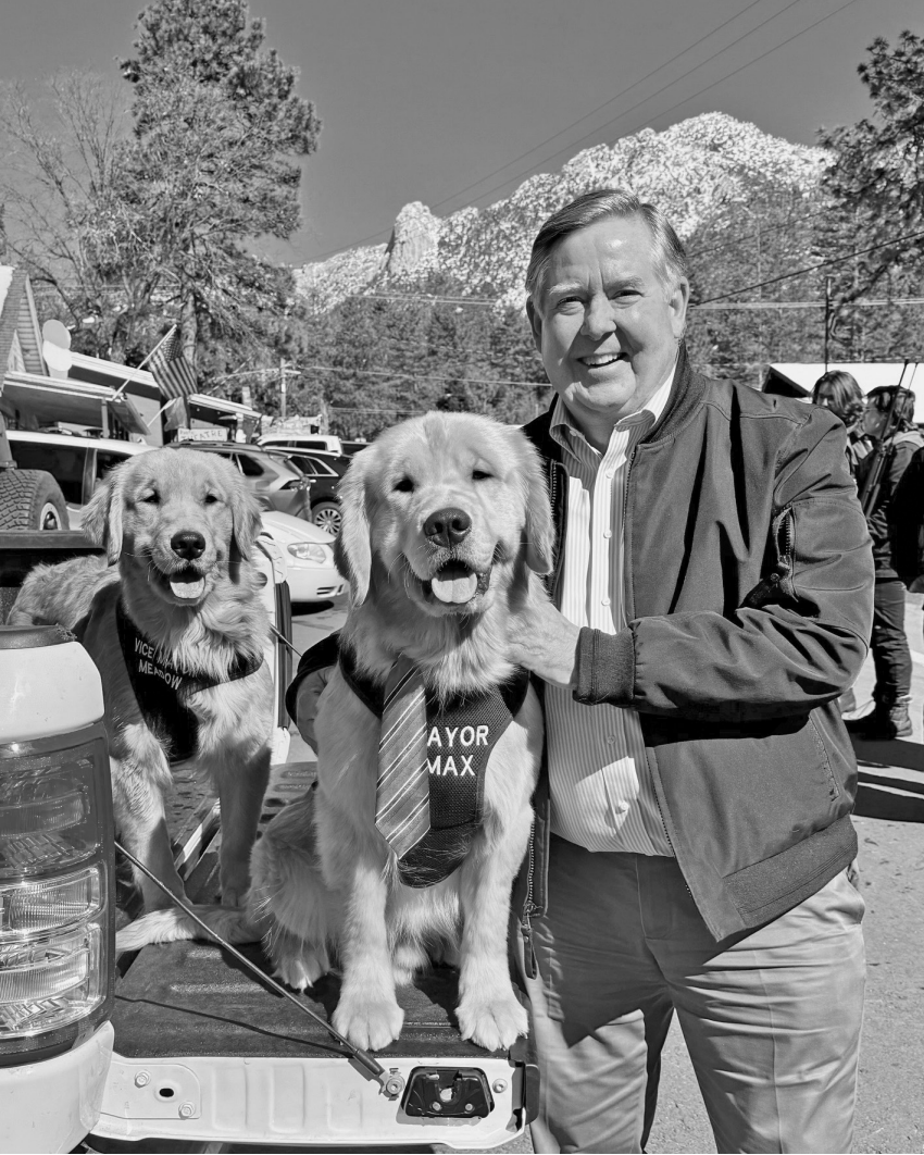
Rep. Ken Calvert last week with Mayor Max and Vice Mayor Meadow.

Enacted in 2014, this proposition lowered many drug possession and property crimes from felonies to misdemeanors. From 2017 to 2022, the number of property crimes of all sorts declined 10% in California. However,