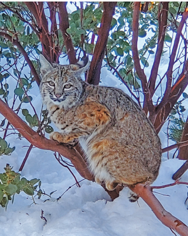
A bobcat on Jameson Drive recently.