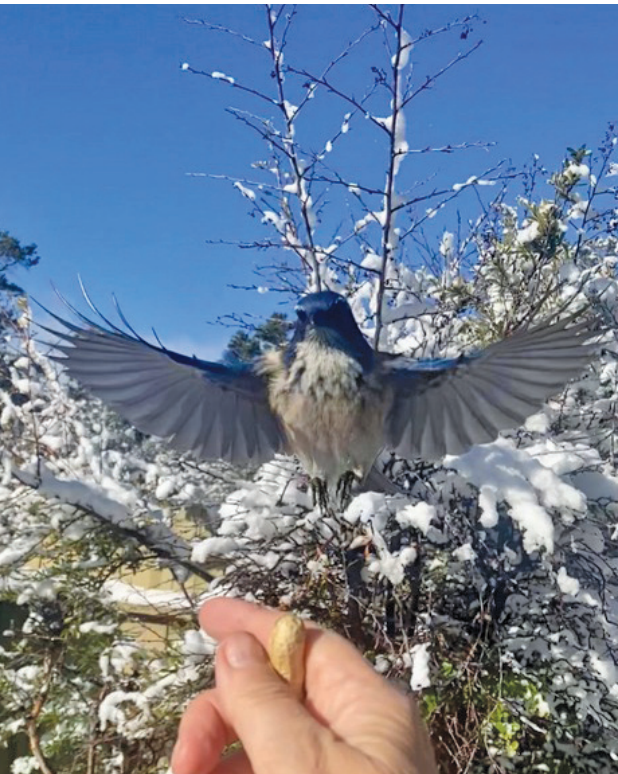
A scrub jay feeding from a hand recently.