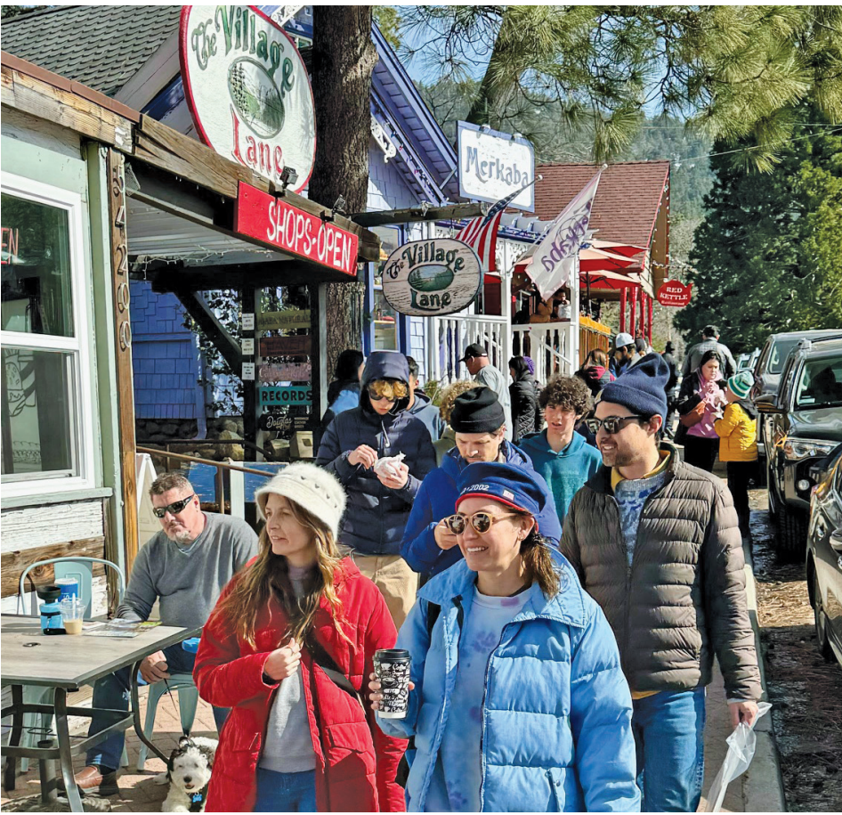
Tourists enjoying the snow, sunshine, shopping and dining in Idyllwild over the weekend.